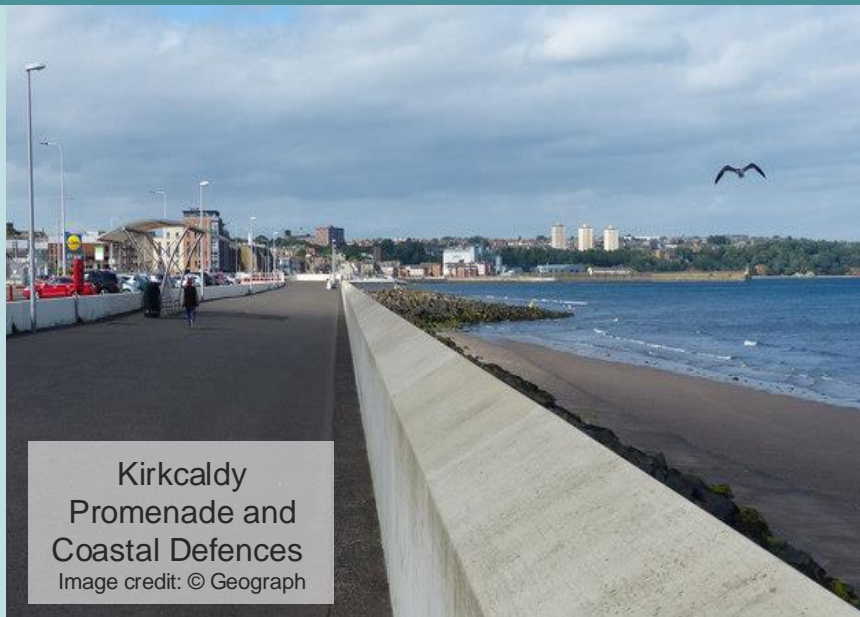
Kirkcaldy Promenade and Coastal Defences

We will learn about coastal values, liabilities, and engagement around coastal impacts. We will learn with and from communities of interest and learn how the council can respond to future coastal impacts.